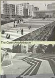
The Gates Amphitheater