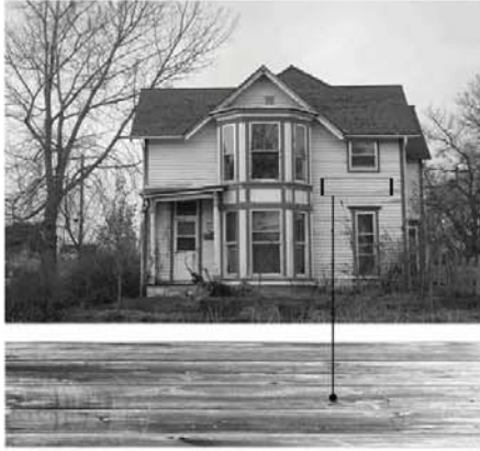
EXISTING SITE + GREYWOOD SOURCE