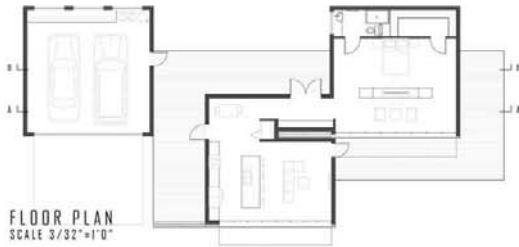
FLOOR PLAN SCALE 3/32" = 1'-0"