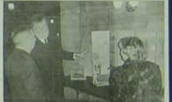
University students help find ways for Albion to compete

University students help find ways for Albion to compete University students from the University of Nebraska-Lincoln (UNL) College of Architecture have helped Albion, Michigan, find ways to compete in the global market. The students, who are part of a research and development project, have identified several key areas for improvement and provided recommendations for the local community. The project was a success, with many attendees expressing their appreciation for the college's efforts. The speakers also discussed the college's plans for future projects and the importance of continued collaboration between the college and the community.