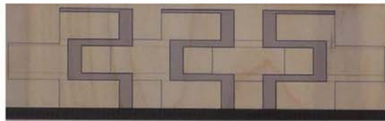
Air circulation Diagram