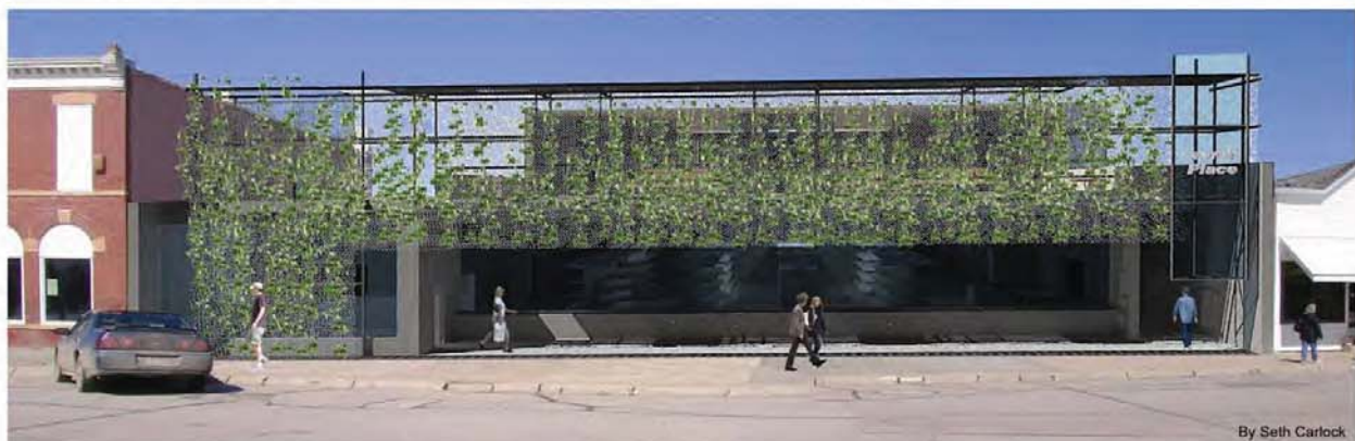
By Seth Cartcock