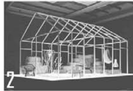
2 'House of Straw' Wallpaper Magazine, 10/08